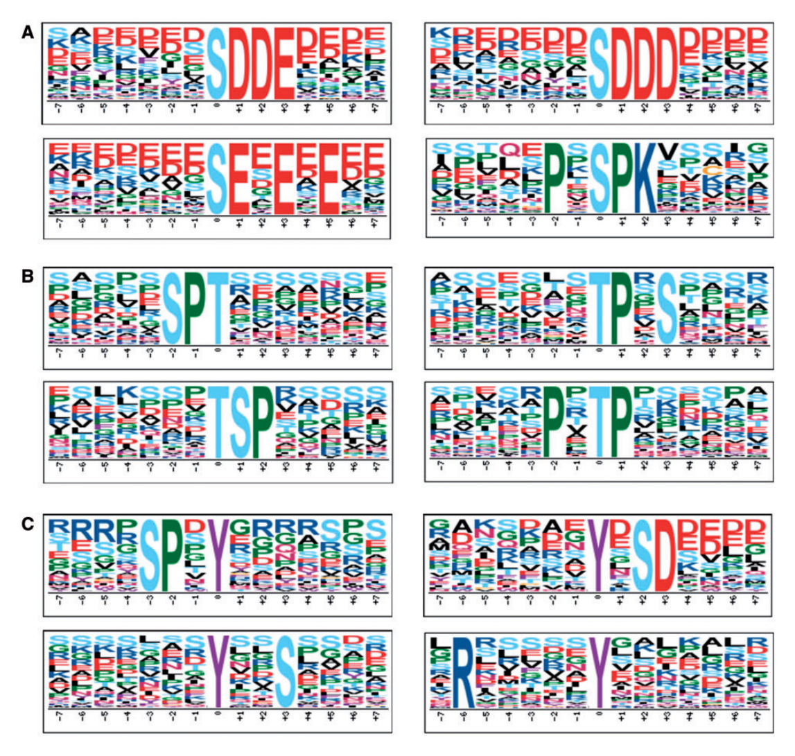
Figure 4. The top four most representative motifs discovered by Motif-x for phosphoserine, phosphothreonine and phosphotyrosine in Arabidopsis . (A) Motifs for phosphoserine. (B) Motifs for phosphothreonine. (C) Motifs for phosphotyrosine. The position 0 represents the modified residues.

Figure 4. For phosphoserine, the top four most representative motifs were pS-D-D-E, pS-D-D-D, pS-E-X-E-X-E and P-X-pS-P-K (pS, pT and pY represent the phosphoserine, phosphothreonine and phosphotyrosine, respectively. X represents any amino acid) (Figure 4A). The top four motifs with the highest scores for phosphothreonine were S-P-pT, pT-P-X-S, pT-S-P and P-X-pT-P (Figure 4B). Previously, it was proposed that [ST]-P motif might be recognized by MAPKs and CDKs (22), which indicated that MAPKs and CDKs might be the primary kinases for the identified phosphoserines and phosphothreonines. Acidic motifs such as pS-D-X-[DE], pS-E-X-E and pS-[DE] were potential substrates of CKII (35, 36), while other motifs such as R-S-X-pS, L-X-R-X-Y-pS and R-X-X-pS were associated with CPKs and CaMKs activity (36, 37). The top four most representative motifs for phosphotyrosine were calculated as S-P-X-pY, pY-X-S-D, pY-X-X-S and R-X-X-X-X-pY, while the potential kinases for