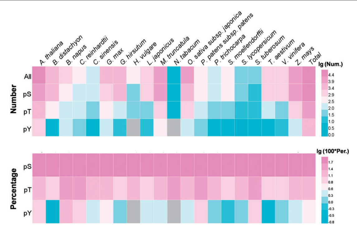
Figure 1. The heatmap for the distribution of site numbers and percentages for phosphoserine (pS), phosphothreonine (pT) and phosphotyrosine (pY) in different species.