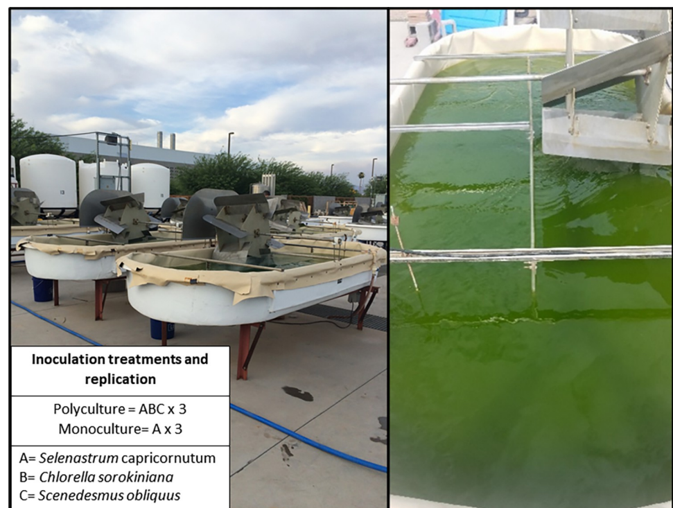
Fig 1. Experimental set-up of outdoor cultivation ponds. Photographs of 400-L experimental outdoor raceways located at Arizona Center for Algae Technology and Innovation (AzCATI) in Mesa, Arizona. Inset text summarizes experimental design.

This experiment used a BACI design (Before, After, Control, Impact) to determine if algal polycultures (the 'Impact' group) increase the production and stability of algal feedstock