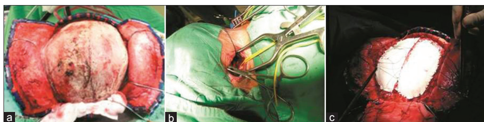
Figure 2: Intraoperative photos of case 2; (a) Bifrontal-parietal craniotomy following "open-book" scalp incision; (b) Temporary clamping bilateral ECAs (c) Skeletonization of diseased superior sagittal sinus and replacing the pathological dura

Temporary clamping bilateral ECAs has been used for surgery of convexity and parasagittal meningiomas, [9,13] which also presented an effective technique without significant complication. By our two cases, we presented here illustrate a simple but effective technique to minimize blood loss by temporary clamping bilateral ECAs. Then numerous and tortuous arterial feeders can be removed by excision of pathological dura replaced by artificial one [Figure 2c]. Occlusion of bilateral ECAs might be complicated with skin necrosis, wound infection or facial pain due to the ischemic effect. Thrombus formation due to clamping of atherosclerotic vessels might cause an embolic phenomenon and permanent occlusion of distal vessels. Therefore, especially in older patients, such vessels should be manipulated very gently and carefully. Ocular ischemic syndrome after the occlusion of bilateral ECAs has been reported. [1] In our two cases, which the clamping lasted about 90 minutes, there was no ischemic effect after temporary clamping of bilateral ECAs. Careful control of ischemic time is necessary to prevent related complications. The mRS of both our cases were zero at discharge. There were good wound healing and no complaint about the facial discomfort of both cases.