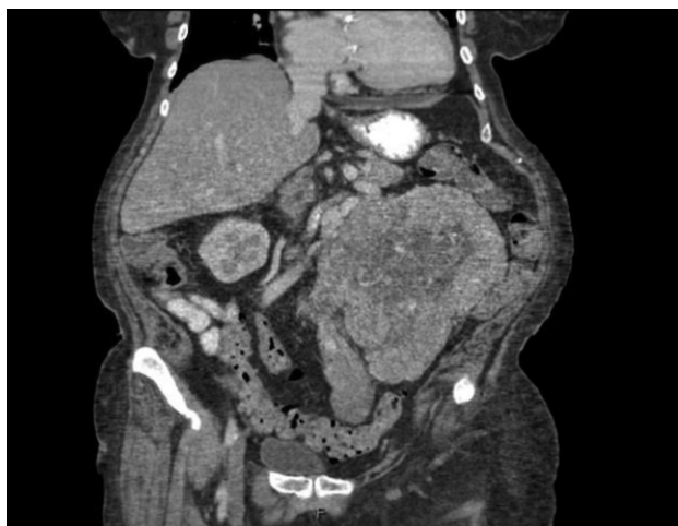
Figure 1: Coronal view of computed tomography of abdomen/pelvis revealing a large left renal mass with direct extension into the left gonadal vein.

The patient's medical and surgical history was unremarkable except for insulin independent diabetes mellitus. A left-sided abdominal mass was palpable on physical exam. Further evaluation revealed no evidence of distant metastatic disease on CT imaging of the head, chest x-ray, recent CT chest, or CT abdomen and pelvis. Magnetic resonance imaging of the abdomen, obtained approximately 1 month prior to her surgery, did not reveal any evidence of left renal vein involvement. After extensive counseling and a thorough discussion of the risks involved and the benefits, she opted for surgical extirpation of her locally advanced renal mass and regional lymphadenopathy. She underwent an open left radical nephrectomy, total abdominal hysterectomy with bilateral salpingo-oophorectomy, and retroperitoneal and pelvic lymph node dissection. Intraoperatively, the mass was found to be large and bulky, extending toward the pelvis and invading the local structures. The ascending colon was reflected medially, at which time the mass was noted to be involving part of the mesentery, which required resection. Once the hilum was controlled, the mass was dissected down toward