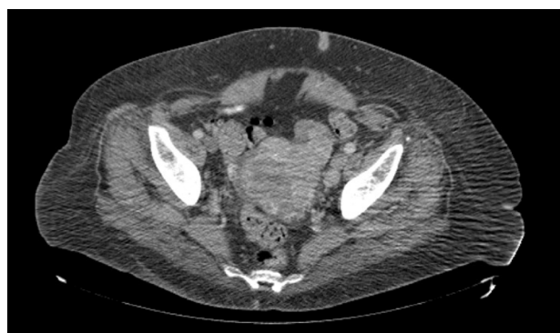
Figure 2: Axial view of computed tomography of the abdomen and the pelvis revealing a heterogeneous appearance of the uterus.

The left kidney, supracervical uterus, bilateral fallopian tubes, and ovaries were sent for histopathological examination. The left kidney measuring 21.0 cm in greatest dimension showed a 15.6 × 11.2 × 11.1 cm yellow, gelatinous, hemorrhagic, and necrotic mass that obliterated the lower pole. The mass invaded the perinephric fat abutting Gerota's fascia, the hilar fat, calyces, and distorted the renal sinus (Figure 3). The proximal renal vein contained tumor, which