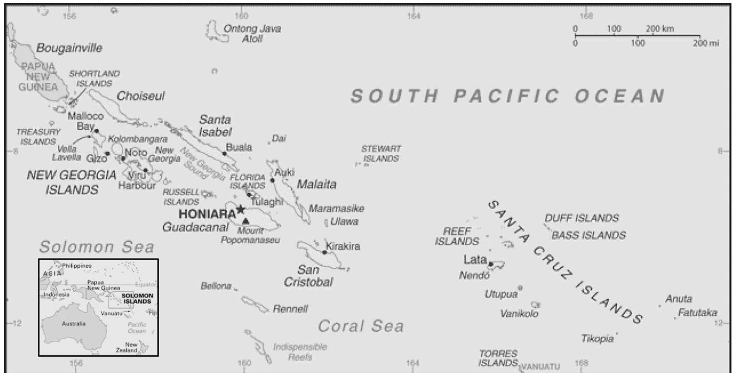
Fig 1. Map of Solomon Islands.

https://doi.org/10.1371/journal.pone.0198487.g001