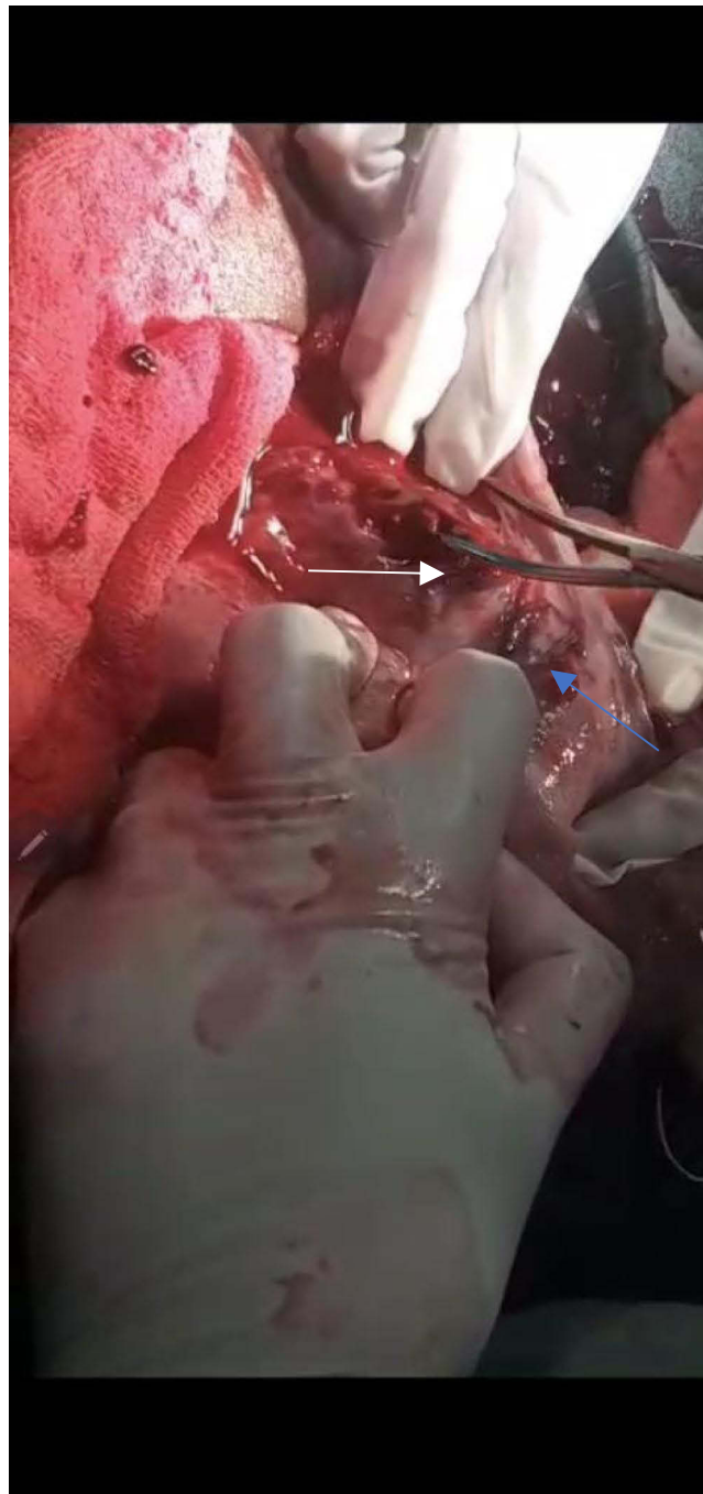
Figure 3 Intraoperative finding, 25 years old pregnant lady at 33 weeks gestation with spontaneous hemoperitoneum due to rupture of uterine vessels. Note: Intraoperative finding, white arrow showing the site of the ruptured uterine venous plexus and blue arrow showing left uterine cornua.

acute and similar to that of our case, the pregnancy was viable, occurred in the early second trimester of pregnancy, and was managed to reach term with a subsequent good foetal outcome. In our case, the foetus was nonviable, and delivery was performed during laparotomy. Most importantly, early detection and management are essential to optimise outcomes for both the mother and the foetus.