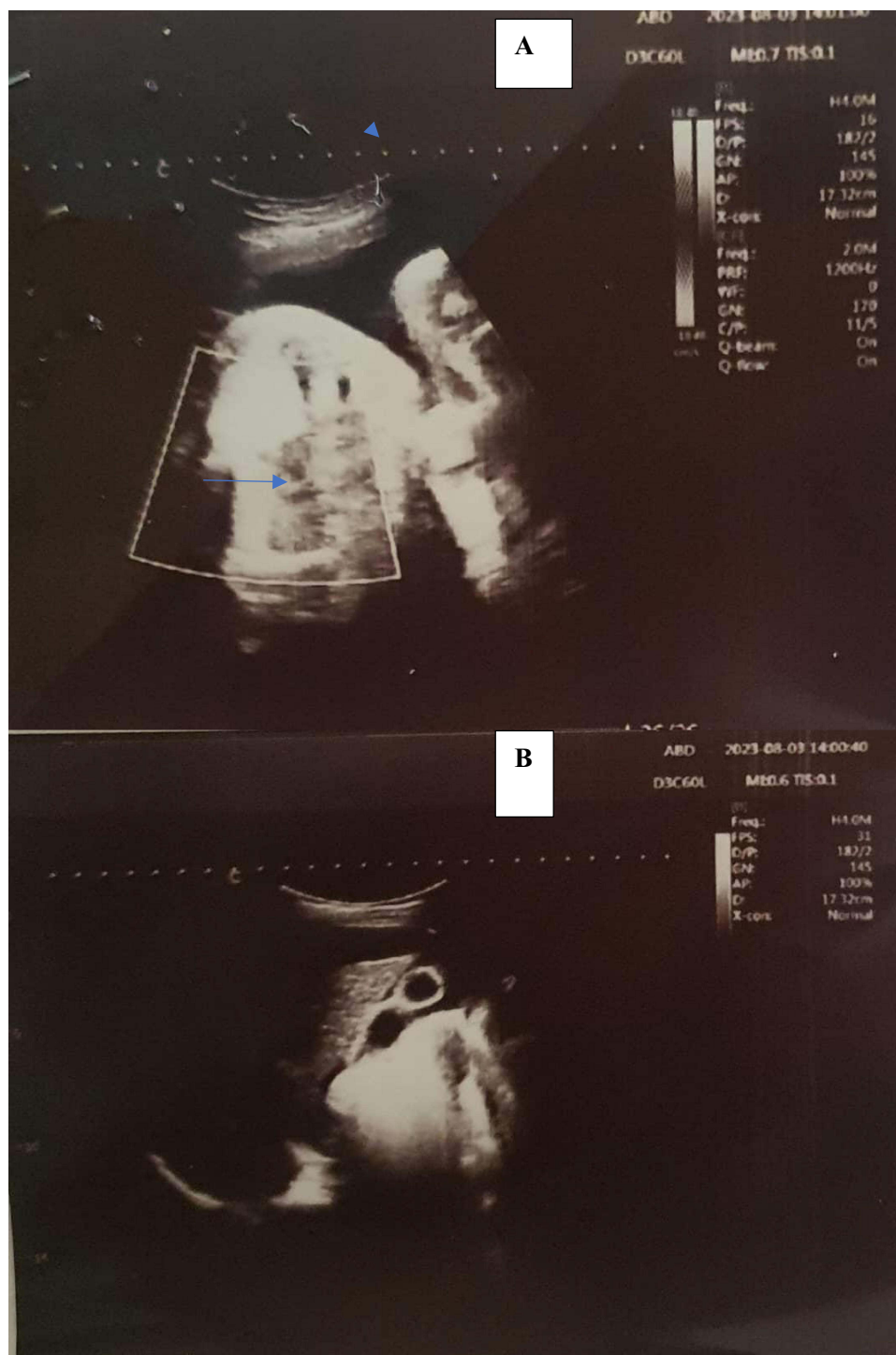
Figure 1 Abdomino-pelvic ultrasound, 25 years old pregnant lady at 33 weeks gestation with spontaneous hemoperitoneum due to rupture of uterine vessels.

Notes: The image labeled (A) showing intrauterine pregnancy, blue arrow showing no colour flow on the fetal heart. The image labelled (B) showing right upper quadrant abdominal ultrasound, white arrow showing free fluid in the hepatorenal recess.