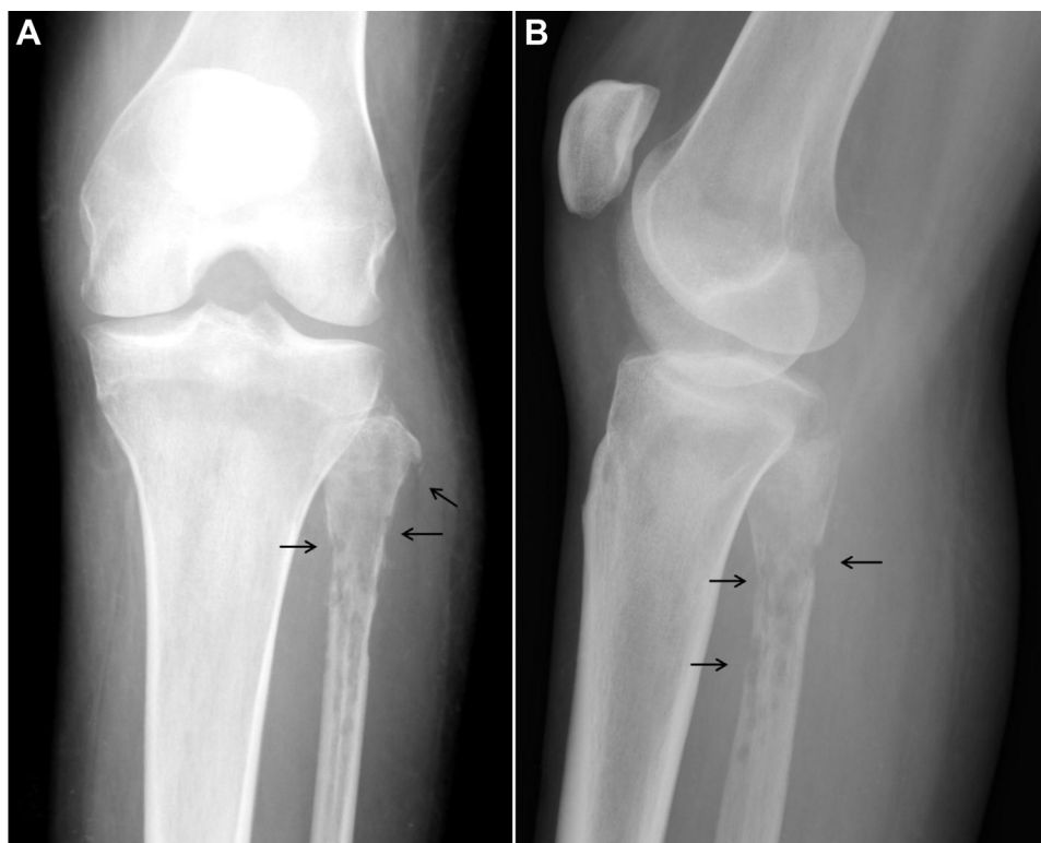
Fig. 1 – A 36-year-old woman with Acanthamoeba spp. osteomyelitis of the left fibula. Frontal (A) and lateral (B) radiographs demonstrate a permeative pattern of lucency within the proximal fibula with interruptions in the cortex (arrows) and soft-tissue swelling.

for discharge to a long-term acute care facility, where she continued to recover and eventually returned home.