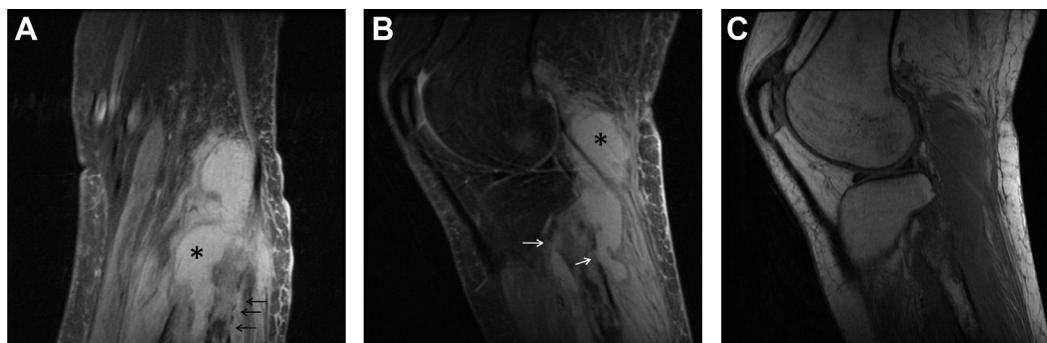
Fig. 2 – A 36-year-old woman with Acanthamoeba spp. osteomyelitis of the left fibula. Coronal (A) and sagittal (B) proton density fat saturation images show high SI within the medullary canal of the proximal fibula. Cortical disruption (arrows) and subcutaneous edema correlate with findings seen radiographically (Fig. 1), and the cortical interruptions are shown to communicate with a homogeneous, high SI collection (*) confirmed at surgery to be an abscess cavity. Sagittal T1WI (C) shows well-circumscribed regions of low internal T1 SI in the proximal fibula.

radiographic and MRI examinations of the left tibia and fibula (Figs. 3 and 4, respectively) showed recurrence of a fluid collection consistent with abscess around the remainder of the proximal fibula. The patient underwent another excisional debridement with resection of the proximal fibula. Pathologic examination of tissue samples again showed organisms consistent with amoebae. Of note, the patient also had tree-in-bud opacities with a right upper lobe predominance and small bilateral pleural effusions on noncontrast thoracic