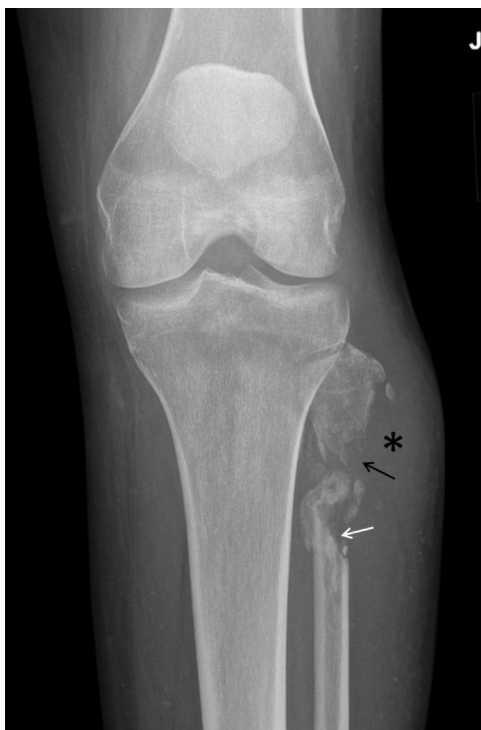
Fig. 3 – A 36-year-old woman with Acanthamoeba spp. osteomyelitis of the left fibula. Repeat frontal radiograph shows progressive destruction of the fibula. The sharp superior margin of the distal piece of the fibula is consistent with prior surgical debridement (white arrow), but the irregular margin along with poor cortication and focal demineralization of the proximal fibula suggests persistent or recurrent infection (black arrow). Homogeneous soft-tissue density in the adjacent soft tissues represents recurrence of abscess (*).

computed tomography which, although nonspecific, was felt could represent pulmonary involvement of acanthamebiasis (Fig. 5).