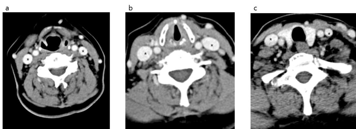
Figure 2. Neck computed tomography axial views of the internal jugular vein (*) and surrounding structures in the anterior neck. hyoid bone level (a). Cricoid cartilage level (b). First thoracic vertebra level (c).

Since the middle level of the right IJV was the largest location in this study and is the most preferred location when accessing the central vein via the IJV, the regression analysis was performed with the right IJV (middle level) [10]. Table 3 shows the results of univariate analysis for the factors associated with the right IJV (middle level) area divided into two groups according to the median area (190.8 mm 2 ). According to these results, cardiovascular disease ( p = 0.003 ), age ( p < 0.001 ), and BMI ( p = 0.024 ) affected vessel size. All factors showing significance were further analyzed by multivariate analysis. Advanced age (OR 1.040; 95% CI 1.022–1.058, p < 0.001 ) and higher BMI (OR 1.080; 95% CI 1.011–1.154, p = 0.023 ) were factors significantly associated with the right IJV area (Table 4).