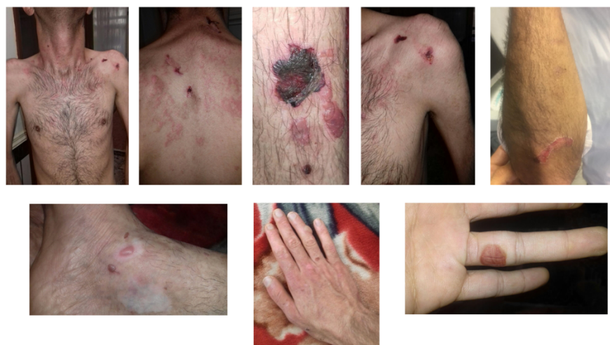
Fig. 2: EBS-MD clinical features with skin scars and neonatal onset generalized blistering, contractures in neck and elbow of patient III

cence at 26 years old (patient III, currently 30 years old) and gradually progressed, resulting in the inability to walk. Patient III showed elbow and neck contracture; on his neuromuscular examination, reflexes were diminished, and Patient III also presented with skin scars and neonatal-onset generalized blistering, blistering of mucous membranes in the mouth (Fig. 2), nail dystrophy in feet, palmoplantar keratosis (Fig. 3), blistering of mucous membranes in the mouth and palmoplantar keratosis appear intermittently and then resolve