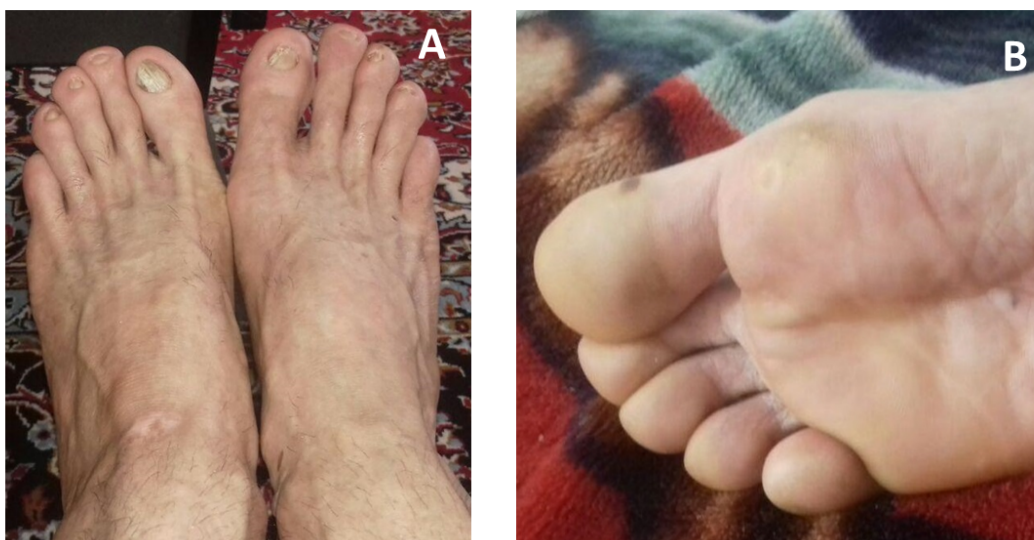
Fig. 3: EBS-MD clinical features of patient III (A): Nail dystrophy (B): palmoplantar keratosis

All three patients showed delayed motor development, proximal muscle weakness progressing to generalized muscles, muscle atrophy, and positive Gowers sign as shown in Table 1.