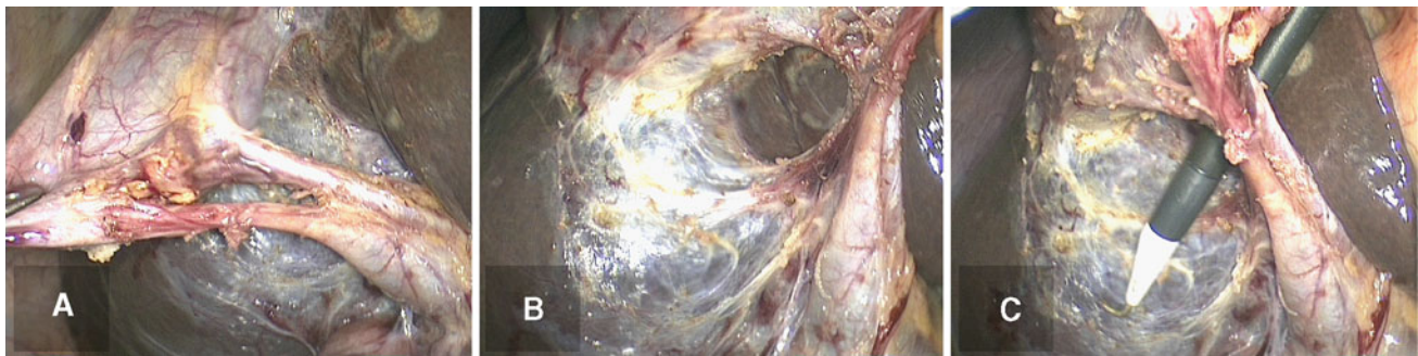
Fig. 1 Correct documentation of the critical view of safety in three photographs. A Medial view. B Lateral view. C View with an instrument through one of the windows to enhance depth perception

Fig. 2 Documentation of the biliary anatomy by intraoperative cholangiography. A Performed correctly. The trajectory of the cystic duct is clearly visible, as well as the intrahepatic bile ducts, the common bile duct, and the duodenum. B Performed incorrectly. Although the intrahepatic ducts and the duodenum are visualized, the cystic duct is not, and it could be the common bile duct that is cannulated instead of the cystic duct