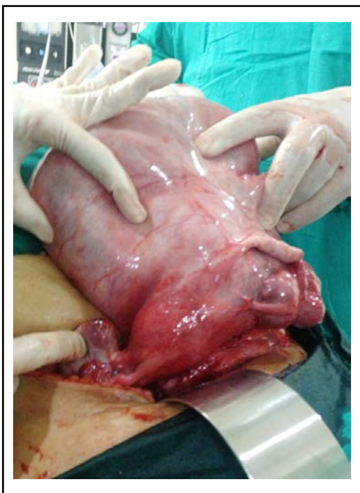
Fig.1: Huge mass with uterus and bilateral ovaries.

On opening the peritoneum the appearance of the tumor was as if the guts were adherent to the anterior surface of the tumor. The mass was arising from the pelvis and extending up to xiphisternum with lateral extensions to both the para colic gutters. It had solid cum cystic consistency and multiple cysts were filled with straw colored fluid. Normal sized uterus was attached to the lower right lateral pole of the mass with a normal looking right and left ovary. Left lateral extension of the mass was encroaching into the retroperitoneum, the pedicle of the tumor was arising from the left lateral uterine border extending into broad ligament.