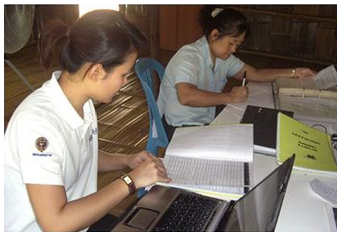
Figure 1 Spatial organisation and infrastructure of clinical trial support group Tracking Resistance to Artemisinin Collaboration (TRAC) monitoring.

quality clinical research monitoring. This approach was then taken up by the East African Consortia and further developed for deployment across this network. This network-wide monitoring approach, which was launched at the start of 2011, is referred to as the East Africa Consortia for Clinical Research Scheme reciprocal monitoring scheme. It involves two coordinators based in Uganda and Kenya and 22 trained monitors nominated by 11 partner institutions (figure 2).