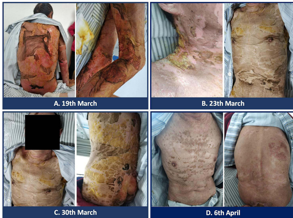
Figure 2 Clinical photograph of the patient recovering from SJS. (A) On March 19, 2020, the patient's skin exudation began to decrease. (B) On March 23, 2020, the patient's skin gradually became dry and started to heal. (C) On March 30, 2020, the patient's skin further healed and was dry without exudation, with only a small amount of bright red skin exposed on the buttocks. (D) On April 6, 2020, the patient's skin damage was significantly healed.