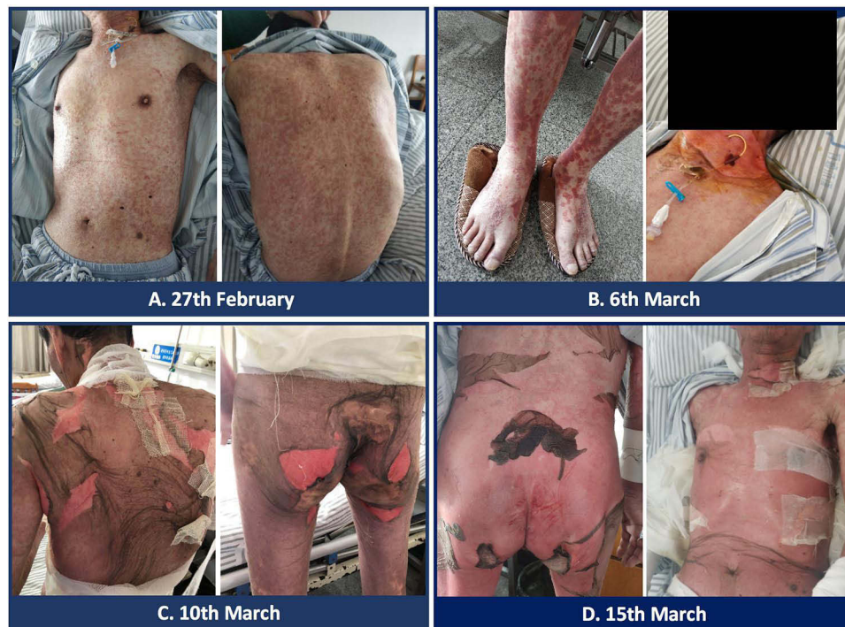
Figure 1 Clinical photograph of the patient demonstrating erythematous plaques and desquamation. (A) On February 27, 2020, the patient developed red rashes on the upper limbs, the front chest, and the back. The rashes were slightly raised above the skin and were not accompanied by itching. (B) On March 6, 2020, the patient's blisters around the mouth, back, and limbs progressed more than before, and the skin on the neck began to peel off. (C) On March 10, 2020, the patient experienced skin peeling on the head, neck, back, and buttocks, with significant pain, and new blisters appeared on the lower limbs. (D) On March 15, 2020, the patient's skin peeling worsened. Skin peeling was also observed on the external genitalia and around the anus, with bright red skin exposed, accompanied by exudation.

and this condition took 1 week to improve (Figure 1C and D). Hence, methylprednisolone was reduced to 80 mg Q12h from 19th March (Figure 2A). Exudation decreased significantly starting 23rd March (Figure 2B and C), and skin-associated symptoms returned to near-normal levels (Figure 2D). On 19th February, the patient underwent CT scan (before sintilimab infusion). On 6th April, the lump in the right lower lung slightly reduced in dimension from 2.7 cm to 2.4 cm (11%) compared to the former CT scan (Figure 3). The patient did not receive treatment with PD1 antibody again.