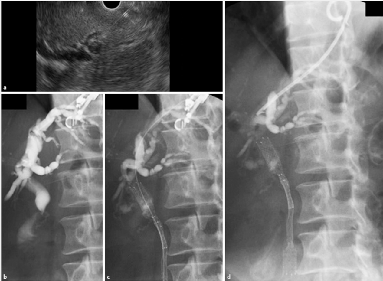
► Fig. 2 a Punctured B2 duct with a 19-G needle. b Insertion of the catheter over the wire and contrasted biliary ducts. c Successfully inserted uncovered metallic stents using the antegrade technique with balloon predilatation. d Insertion of a temporary single pigtail plastic stent from the left intrahepatic bile duct to the esophagus to prevent biliary leakage.