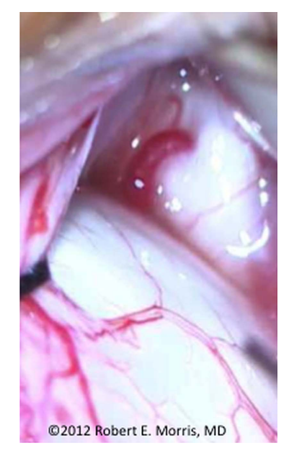
Figure 3 Vortex vein, after conjunctiva retracted intraoperatively, exiting posterior scleral eye wall.

While such an occurrence may initially seem implausible, it is not so difficult to imagine upon reflection. Each of the ocular vortex veins can be as large as the infusion cannula (figures 2 and 3), and entrainment through these vortex veins is the most likely explanation for CT imaged air in the orbit in the report of possible OAFE/VAE by Ledowski.<sup>1</sup> Moreover, a choroidal detachment was actually seen during the OAFE in Ledowski's report, and the characteristic mill-wheel murmur of VAE stopped immediately after ocular air infusion was discontinued, with prompt cardiopulmonary recovery.