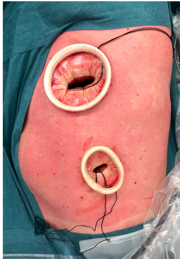
Figure 1. VATS approach with two incisions. A utility incision performed in the 4th intercostal space and a video-port at the 7th intercostal space.

All surgery was performed in lateral decubitus position with single lung ventilation and general anaesthesia. VATS lobectomies were performed through two incisions: a 15-mm video-port in the 7th or 8th intercostal space in the mid-axillary line where the 30° camera was placed through a soft tissue retractor (Alexis, xs, Applied Medical, California) and a 30-mm utility incision was performed in the anterior axillary line in the 4th or 5th intercostal space and another soft tissue retractor (Alexis, s, Applied Medical) was placed (Figure 1). RATS lobectomies were performed using DaVinci robot surgery system type Xi (Intuitive, California) with a four arms approach. It was carried out through a utility incision at the fourth intercostal space and three additional ports without CO 2 use, according to the Park-Veronesi technique. (Figure 2).