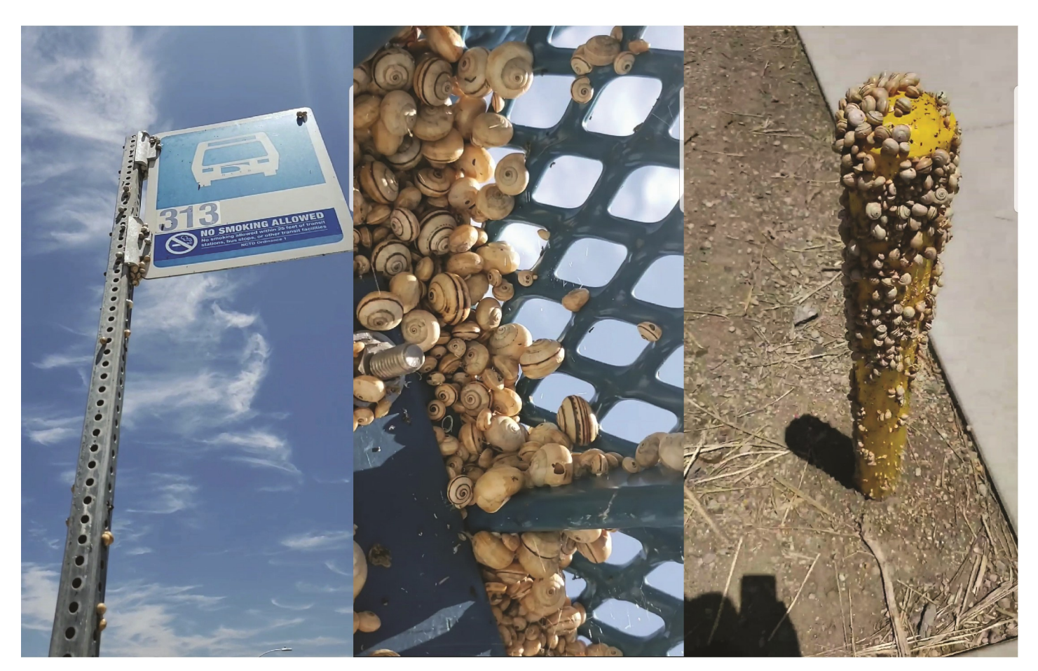
Fig 1. Left to right: Theba pisana aestivating on a bus stop sign; beneath a bus stop steel bench and on a yellow pole near a sidewalk in Oceanside, CA. https://doi.org/10.1371/journal.pone.0228244.g001