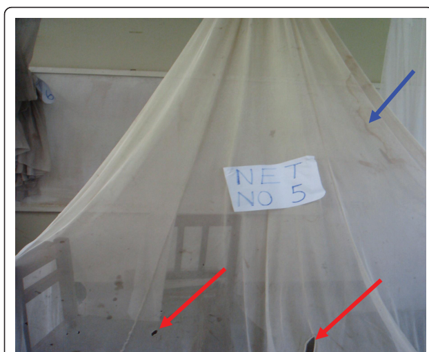
Figure 1 A sample PermaNet ® 2.0 collected from the community houses after 5 years of use. A RED arrow points the holes which are due to mechanical contacts with bed angles while a BLUE arrow shows a mark on the net due to the firewood smoke indoors.

On each net, four WHO contact bioassay cones were attached and a total of 10 mosquitoes were introduced into each cone. Two to three days old, unfed female of An. gambiae mosquitoes were used [23]. Wild populations of An. arabiensis and Cx. quinquefasciatus were collected from an area described by reduced susceptibility to pyrethroid insecticides [21,22]. The mosquitoes were exposed on each net for 3 minutes and then transferred to holding paper cups and provided with 10% sugar solution soaked in absorbent cotton wool [23-25].