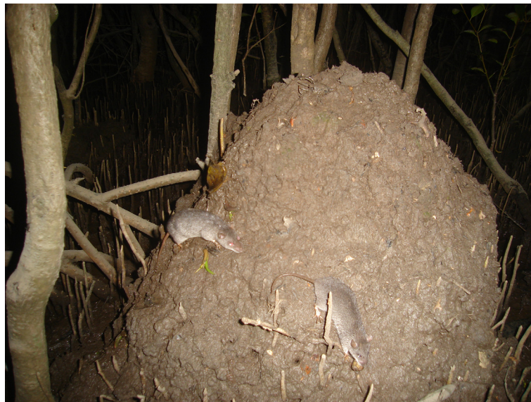
Fig 1. Two water mice maintaining a mound-style nest in a mangrove vegetation community of Sector 3 of the Maroochy River system, 8 th March 2012.

The water mouse ( Xeromys myoides ; also known as the false water rat or 'yirrko') is a small carnivorous rodent (~40 g) that builds and occupies elaborate nest structures in intertidal zones dominated by mangrove (e.g. Avicennia marina var. australasica , Bruguiera gymnorhiza , Aegiceras corniculatum , Rhizophora stylosa , Excoecaria agallocha ) and saltmarsh (e.g. Enchylaena tomentosa var. glabra , Sarcocornia quinqueflora , Sporobolus virginicus , Isolepis nodosa , Juncus kraussii ) vegetation communities (Fig 1; [5,6]), which are preferred habitat for this species. The distribution of the water mouse is currently known to extend from Papua New Guinea to the north coast of Australia and in eastern coastal wetlands as far south as the Gold Coast in southeast Queensland [7,8]. The Maroochy River is approximately 135 km from the southern edge of the species' known range. Water mouse populations are believed to have become locally extinct from the Coomera River over the last few decades [7,9]. The ecological roles of the water mouse are not clear. However, as one of the few native terrestrial mammals occupying these wetlands, it is likely to be an important predator of molluscs and crustaceans, prey for nocturnal raptors, reptiles and other species [10], and potentially provides ecosystem services for other native animals through the construction of mud nests that represent small islands in the intertidal zone.