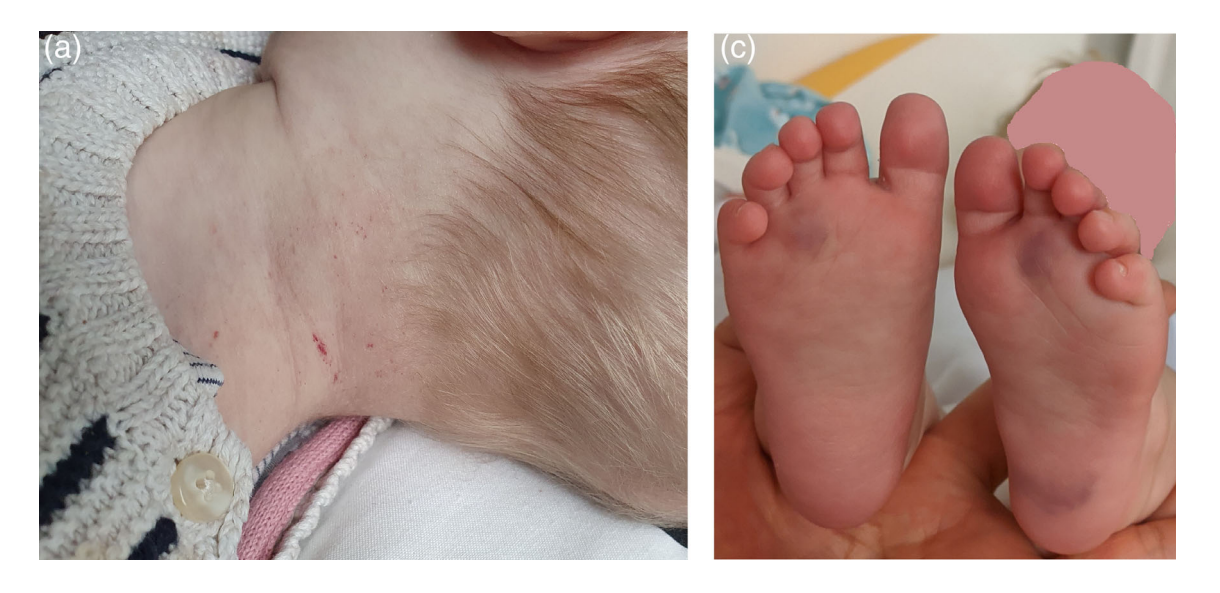
FIGURE 2 (a) Spontaneous petechial rash after viral infection. (b) vascular malformations on the foot soles [Color figure can be viewed at wileyonlinelibrary.com]

We expect the duplication to have a dominant negative effect on the formation of collagen IV formation. Although it is not certain that this intragenic duplication is the sole cause of the cerebral microbleeds, the pre-test suspicion of a COL4A1/2 mutation (based on the prenatal onset of intracranial hemorrhage and microcephaly; Zagaglia, Selch et al. 2018), the elevated CK which was previously reported in patients COL4A1 variants (Tonduti, Pichiecchio et al. 2012) and the fact that the duplication was found to be de novo render a contribution of the duplication to the phenotype likely. Patients with pathogenic variants in COL4A1/2 predominantly have microbleeds in basal ganglia, as was the case in our patient (Renard 2018). The presence of calcifications, as suggested by computed tomography, has also been described in patients with COL4A1 mutations before (Livingston, Doherty et al. 2011). Importantly, more