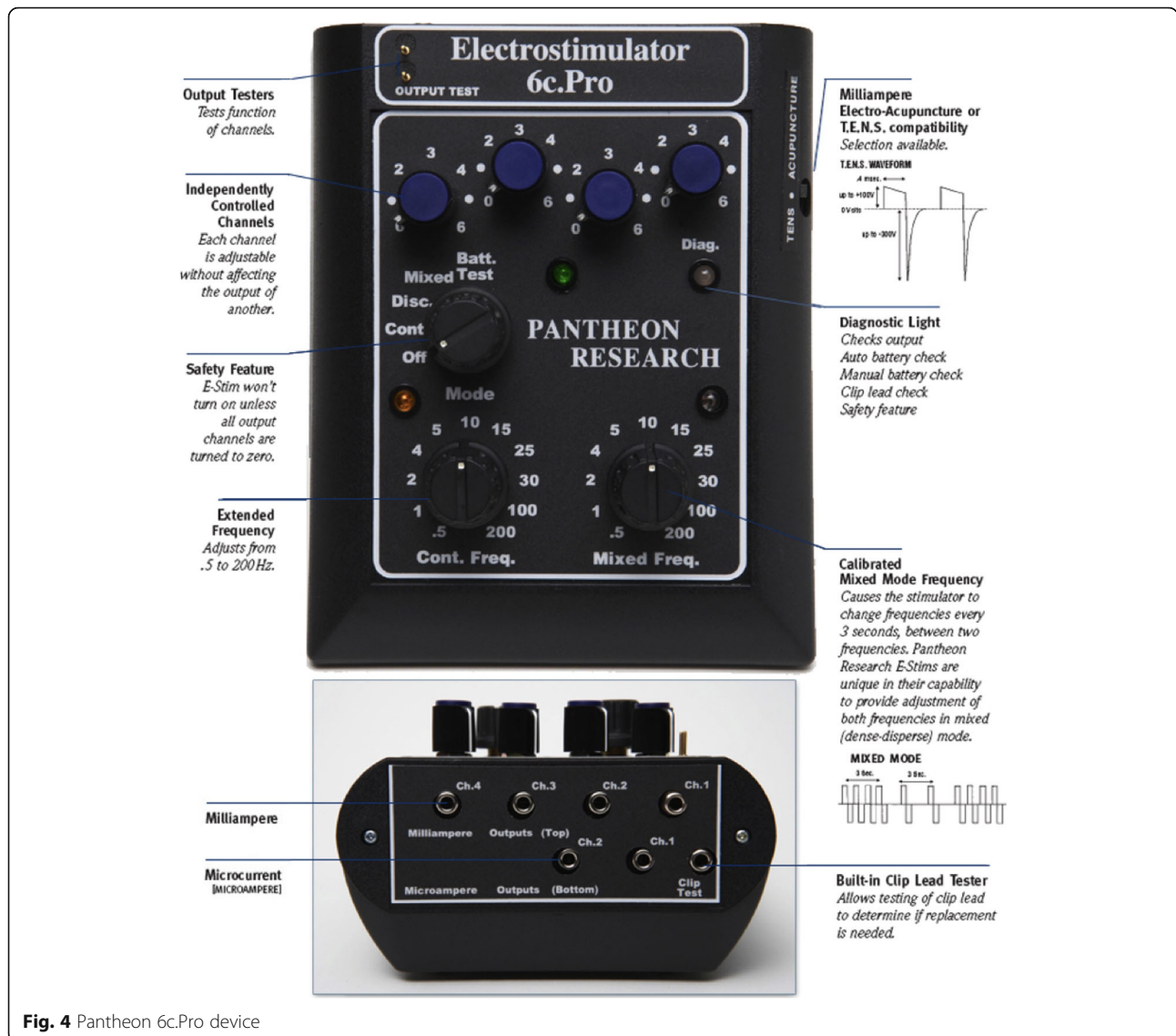
Fig. 4 Pantheon 6c.Pro device

regulations. All research materials will be used for research purposes only.