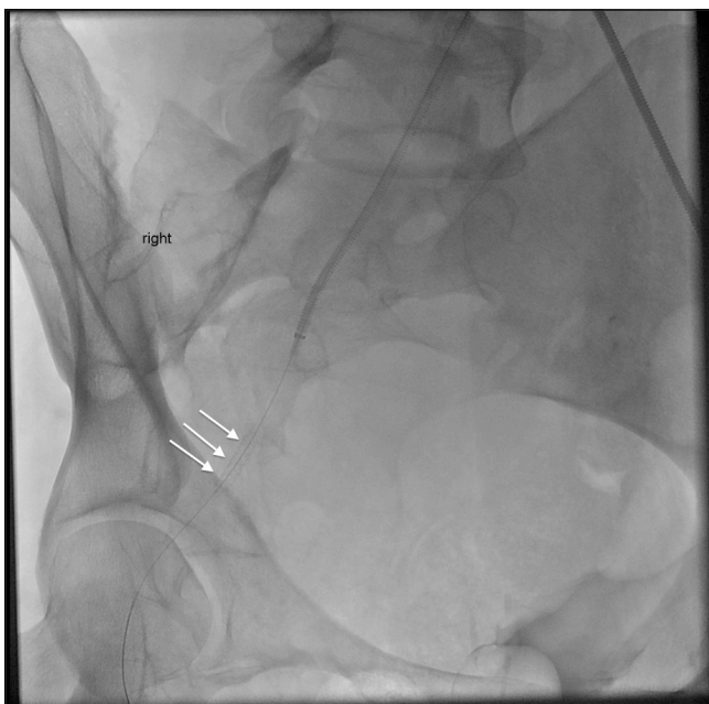
Fig 4. The bleeding site was treated with a 3mm x10mm coronary artery covered stent (Jo Stent Graftmaster) (white arrows).

Transvaginal oocyte retrieval is a frequently performed assisted reproduction technology (ART) procedure. Under direct ultrasound guidance an aspiration needle is passed through the lateral fornix of the vagina into the stimulated ovary with subsequent aspiration of follicles.