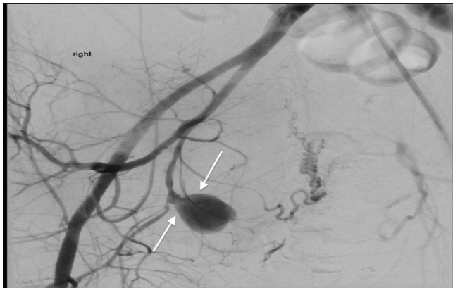
Fig 3. Up and over selective cannulation of the right internal iliac artery was performed and demonstrated a 2cm saccular obturator artery pseudoaneurysm (white arrows).

neck was crossed with a combination microcatheter .014 wire. The bleeding site was treated with a 3mm x10mm coronary artery covered stent (Jo Stent Graftmaster) (see Fig 4). Subsequent DSA showed good stent position and cessation of extravasation of contrast (Fig.5). The patient made a rapid full recovery and a follow up CTA performed the next day confirmed good stent positioning with no extravasation of contrast into the treated pseudoaneurysm.