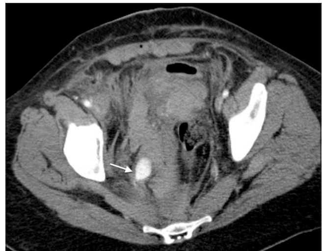
Fig 2. CTA demonstrates a vascular "blush" of a 2cm pseudoaneurysm and active extravasation from a branch of the right internal iliac artery (white arrow).

further surgical exploration was pursued as no intraperitoneal bleeding was observed and because of the risk of severe bleeding associated with decompressing. She was transfused and haemodynamically stabilised with 5 units of packed red cells, 3 pools of plasma (Octaplast) and 2 pools of platelets and referred for radiological management. CT angiography (CTA) of abdomen and pelvis demonstrated active bleeding from a right internal iliac artery branch pseudoaneurysm and a large retroperitoneal haemorrhage (Figs 1 and 2). She was transferred directly to the angiography suite for emergency endovascular assessment and therapy.