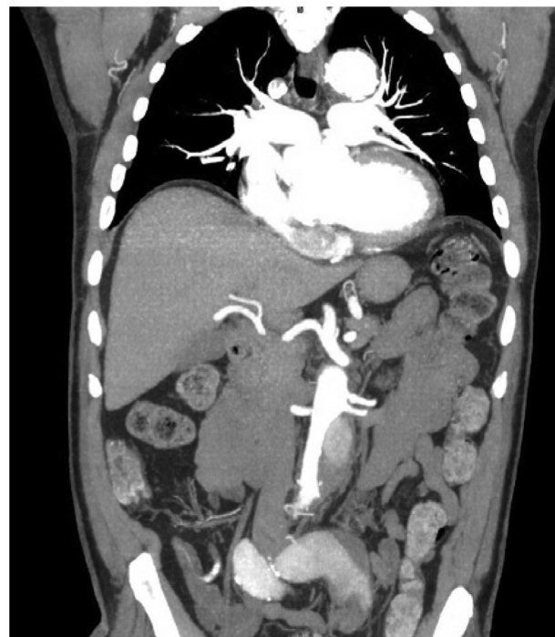
Fig 2. Coronal cut of computed tomography (CT) angiogram demonstrating infrarenal abdominal aortic dissection and tortuous left common iliac artery (CIA) with associated dissection.

out the contralateral side, and the device was pulled down to the aortic bifurcation and deployed. The repair on the left was extended using a 16- × 120-mm Gore iliac extender. The infrarenal and aortic device was ballooned into place for fixation. Next, a 23- × 10-cm right IBD was deployed using a buddy wire to facilitate appropriate orientation of the IBD. Whereas extreme tortuosity of the iliac vessels made deployment difficult, the 12F sheath from the left was advanced over the bifurcation through the iliac branch endoprosthesis (IBE) device, and a directional catheter was used to cannulate the internal iliac artery (Fig 3, C). Using a Rosen wire (Cook Medical) parked in the internal iliac artery, a 12-mm × 7-cm Gore internal iliac artery limb was deployed and ballooned into place. The external iliac limb of the IBD on the right was released and ballooned into place (Fig 3, D). This was followed by deployment of a 28- × 95-mm infrarenal aortic cuff just below the level of the lowest renal artery, which was marked with aortography. Completion angiography demonstrated excellent filling of the renal arteries, aortic endograft, both iliac limbs, and right internal and external iliac arteries as well as of the left external iliac artery. Although