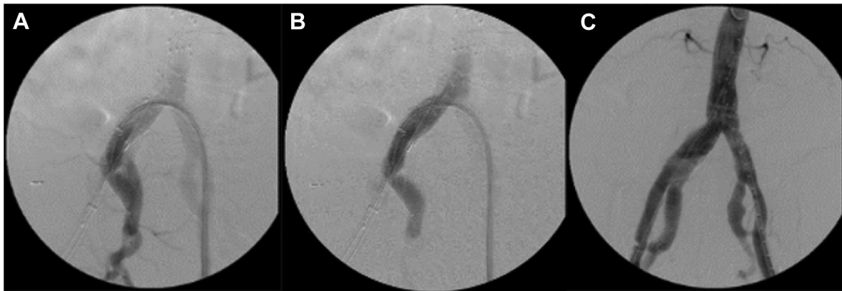
Fig 4. A , Iliac branch endograft being deployed in the right iliac limb of the AFX endograft deployed on the aortic bifurcation. B , Deployment of two Gore endoprostheses in overlapping fashion through right internal iliac artery. C , Completion angiogram with total exclusion of the right common iliac artery (CIA) aneurysm and preserved flow in the right internal iliac artery.

angiography from 3.1 to 3.5 cm. The right internal iliac artery had increased in size from 2.0 to 2.2 cm, so the decision was made for planned endovascular repair. As there was no proximal landing zone to perform an isolated CIA aneurysm repair, the planned repair was to use the AFX device to sit on the aortic bifurcation and to use the right limb of the aortobi-iliac device to land an IBD to exclude the right CIA aneurysm and to preserve flow in the right hypogastric artery.