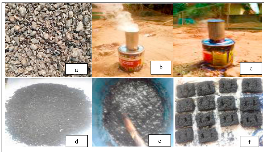
Figure 2. Sequential stages in shell briquette preparation: a. Shells before combustion; b. Initial combustion; c. Final stage; d. Pulverized charred shells; e. Thick char paste; f. PK briquettes.

The total quantity of biochar used as well as the number of briquettes produced were 1350 g and 10 briquettes respectively. The central holes incorporated into the briquettes (Figure 2f) produced by the designed