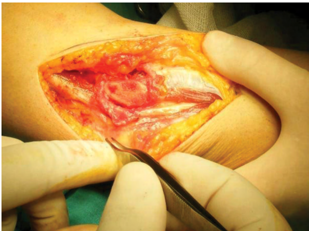
FIGURE 1. Partial medial epicondylectomy.