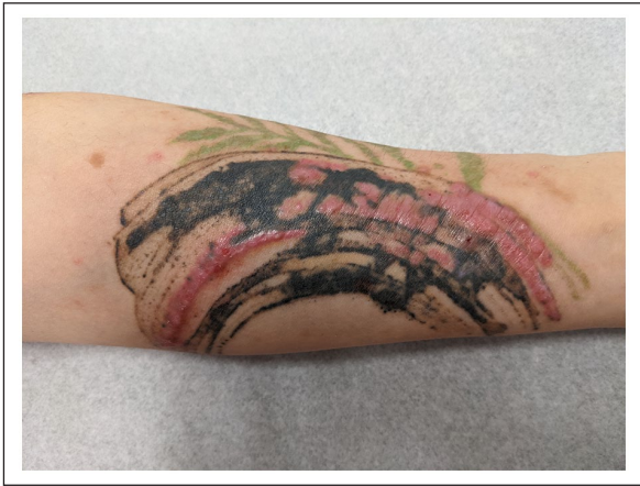
Figure 1. Cutaneous manifestation of localized allergic contact dermatitis to tattoo pigment following laser treatment. Patient's laser-treated, left forearm (arch tattoo) shows erythematous, indurated plaque at site of laser tattoo removal.