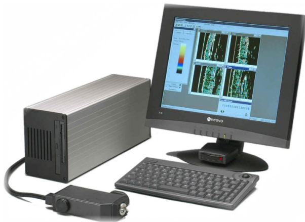
Figure 1 Ultrasonographic equipment (Dermascan C, Cortex Technology).

The ultrasonic wave is partially reflected at the boundary between adjacent structures and generates echoes of different amplitudes. The intensity of the reflected echoes is evaluated by a microprocessor and visualized as a colored two-dimensional image. 1 The color scale of echogenicity is: white – yellow – red – green – blue – black. Normally, the epidermal echogenicity appears as a white band, the dermis is expressed as a two-color composition: yellow and/or red, and the subcutaneous layer appears either green or black (Figure 2).