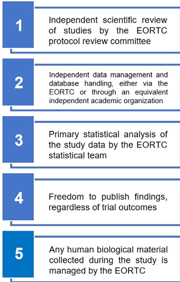
Figure 2 The EORTC principles of independence for research projects in which it collaborates with external partners, including pharmaceutical companies. EORTC, European Organisation for Research and Treatment of Cancer.

or funders, including other academic organizations (e.g., Breast International Group), manufacturers of pharmaceuticals, and in vitro diagnostics (Agendia, Hoffmann-La Roche, Novartis, and Sanofi-Aventis), patient advocacy groups (e.g., Europa Donna), policymakers (the European Commission), and nonprofit organizations (e.g., the Breast Cancer Research Foundation (BCRF)). The investigators involved in this study achieved major economic and health benefits by establishing that many patients with early-stage breast cancer who are considered at high clinical risk of recurrence can be spared from aggressive types of adjuvant chemotherapy without significantly impacting their risk of distant metastasis at 5 years. 29 The extensive cross-company involvement in its conduct can be explained by the lack of commercial interest in its results on the part of most of the participating industry partners (Agendia being a notable exception). The MINDACT trial illustrates the growing interest in the molecular characterization of tumor cells to improve health outcomes, which has led to an increased incorporation of translational research in cancer clinical studies.