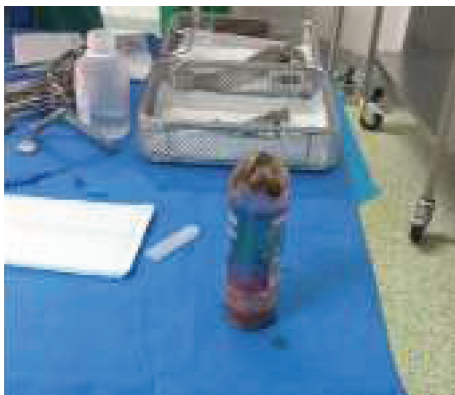
FIGURE 3: Surgically extracted rectal foreign object.