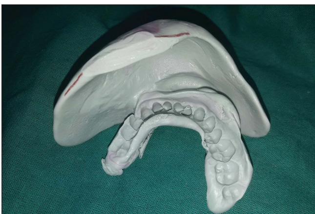
Figure 3: Combined intra- and extraoral secondary impression