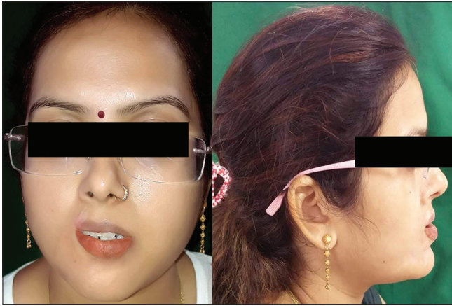
Figure 9: Final prosthesis after extrinsic coloring: frontal and profile views

and communication is undeniable. Any lip deficiency naturally leads to speech impairment and drooling of food and saliva. [6] The prominent location makes it impossible to be missed by the eye. Therefore, a meticulous and swift correction of the defect is imperative to the patient's psychological well-being.