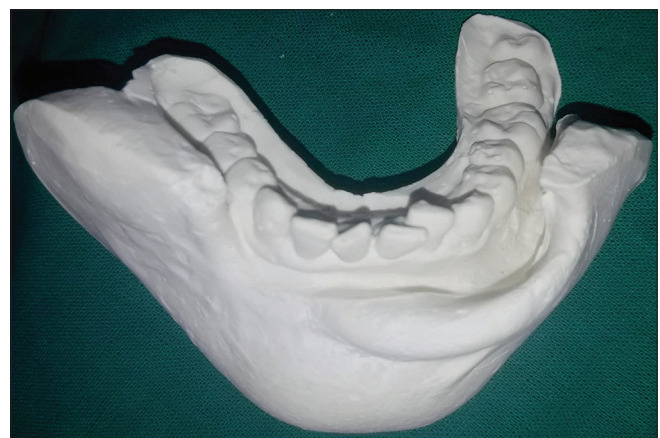
Figure 4: Model of lip defect