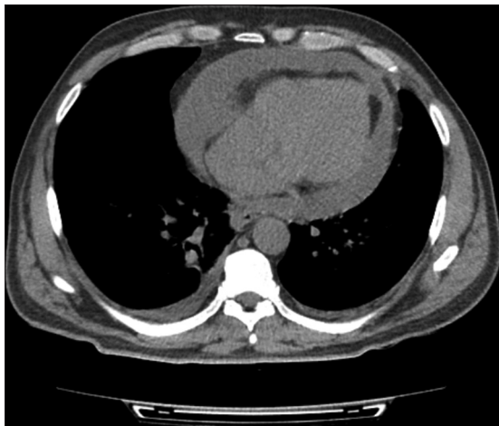
Figure 3: The excess pericardial and minimally right pleural fluid was detected on thorax computed tomography