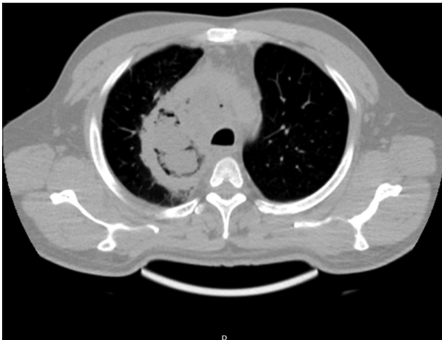
Figure 2: A suspicious abscess appearance was observed in the right paratracheal mediastinal region where biopsies taken place previously