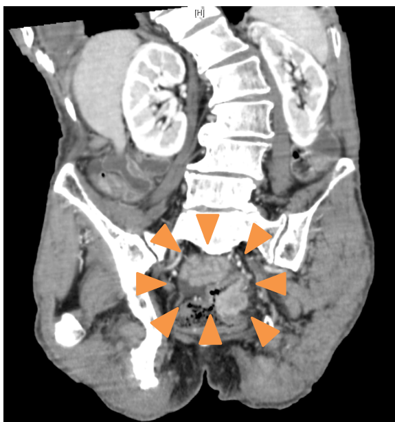
Fig. 1 An abdominal computed tomographic scan revealing a mass lesion in the rectum (orange arrowheads)

The CNPI comprises six items that evaluate pain, including nonverbal vocal complaints, facial grimaces and/