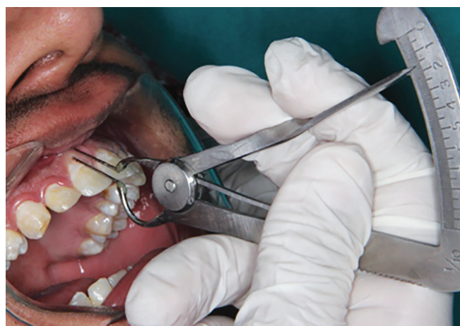
Fig. 2: Gingival biotype identified using modified gauge tip