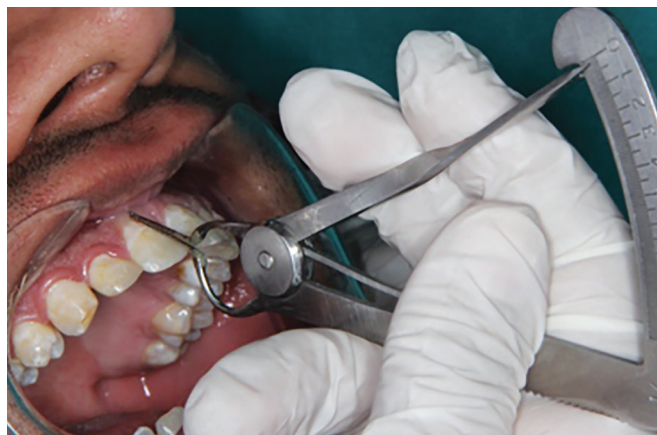
Fig. 3: Direct measurement of gingival thickness using modified gauge

0.9 mm, more prevalence occurs in posterior segment, and the probe visibility showed tendency toward thick biotype variant. Moreover, for gingival thickness of 0.7 mm, the probe visibility showed tendency toward both thin/thick biotype variant in both anterior and posterior segments (Graph 1) (Tables 1 and 2).