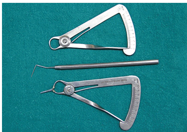
Fig. 1: Modified Iwanson's gauge (Iwanson's gauge with calibrated periodontal probe tip)

The reproducibility of the measurements was evaluated in 10 volunteers. A strong positive Pearson's correlation coefficient of 0.8478 ( p < 0.0001 ) was noted. The method to evaluate the gingival thickness and biotype proved to be highly reproducible. The frequency distribution of the gingival thickness showed the biotype was thin (100%) when the gingival thickness was 0.3 and 0.4 mm and thick (100%) when the gingival thickness ranges between 1.0 and 1.2 mm with more prevalence in anterior and posterior sites respectively. For gingival thickness of 0.5 and 0.6 mm, more prevalence occurs in anterior segment and the probe visibility showed tendency toward thin biotype variant. For gingival thickness of 0.8 and