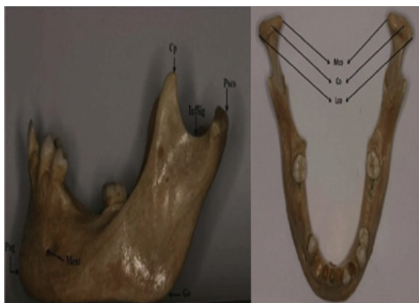
Fig. 1. Anatomical points used as references for the measurements. Sagittal and coronal views.

The measurements on the CBCT images were the same as those carried out on the mandibles with the digital caliper. A high precision digital caliper with a standard error of 0.02 mm [Halfords Advanced Professional Vernier®, United Kingdom] was used to obtain the real measurements from the human mandibles. Each mandible was scanned with the Picasso Dental Master 3D® system [Ewoo technology, Republic of Korea, 2005].