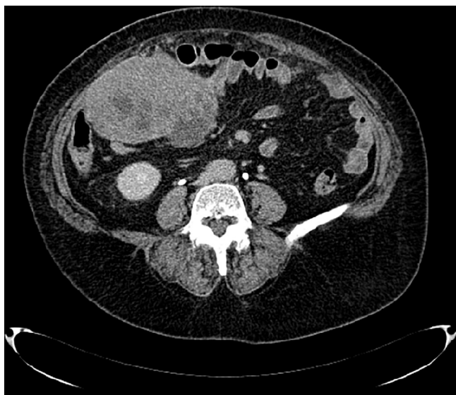
Fig. 1. Computer tomography of her abdomen showed an abnormal mass with areas of necrosis below the transverse mesocolon, measuring approximately 17 cm × 11,5 cm × 9.5 cm.

fallopian tubes and uterine corpus was normal. The postoperative course was unremarkable. The patient did not receive any cycle of chemotherapy and was alive with a follow up of 15 months. The histopathology revealed findings consistent with a malignant mixed mesodermal tumor, measuring cm 12. The radial, proximal and distal margins were negative. No metastasis in 2 lymph