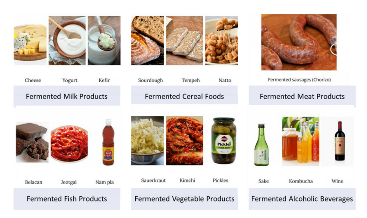
Figure 1. Examples of fermented foods and beverages based on divergent raw food substrates found around the world.