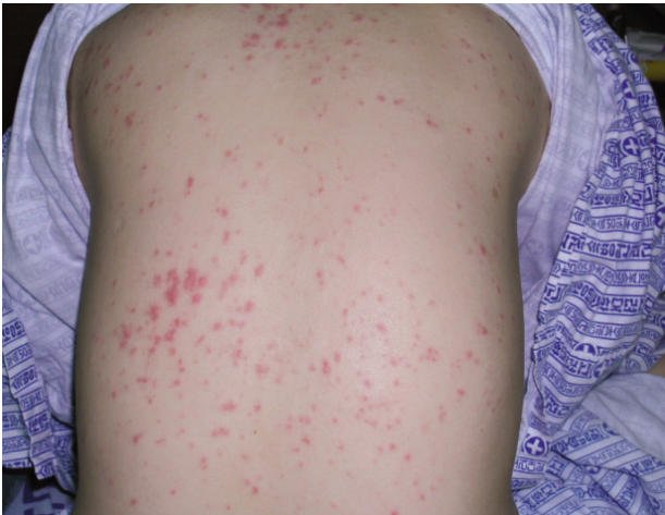
Figure 1. Rash on the back of the patient. Diffuse erythematous papular lesions are noted.