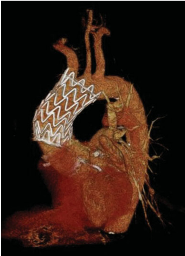
Fig. 3 Computed tomography angiogram three-dimensional (3D) reconstruction at 8 months after endovascular repair.

In conclusion, the use of a transapical access for the deployment of an ascending thoracic aorta endograft seems safe and feasible also in case of prosthetic aortic valve; it may be used to extend indications for aortic repair in selected patients who are at high surgical risk and cannot wait for a