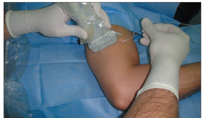
Figure 4: US probe and needle position to scan and block the medial antebrachial cutaneous nerve