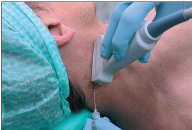
Figure 1: Ultrasound probe and needle position to scan and block the greater auricular nerve

With the subject in supine position, the arm is 90 degrees abducted and externally rotated. We use 6-13 MHz linear US probe to scan the medial aspect of the arm. The US probe is adjusted over the skin perpendicular to all planes. Short axis view of the mid-arm region will show the biceps brachii muscle, brachialis muscle, brachial artery, basilic vein, and median and ulnar nerves. After identifying these structures, we move the US probe proximally to view the nerve. The MACN is embedded within two fascial layers. These fascial layers together with the MACN give a characteristic “EYE” sign [Figures 4 and 5]. MACN diameter is 2.5±0.4 mm