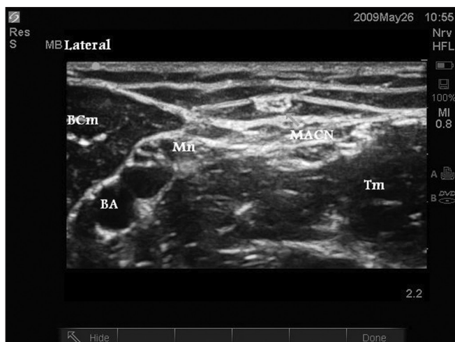
Figure 5: Sonography cross-section view at mid-arm level. MACN, medial antebrachial cutaneous nerve of the forearm; BCm, biceps muscle; Tm, triceps muscle; Br, brachial artery; Mn, median nerve