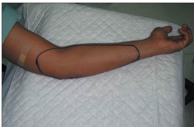
Figure 6: The blue ink map out the sensory area of the MACN

(2-3.5 mm). After skin antiseptic preparation a 22G 50 mm facet tip needle introduced in-plane from the lateral side of the US probe and 2 mL bupivacaine 0.5% is injected. Blocked areas are as follows: Distal part of the anteromedial arm, medial side of the antecubital fossa, area over the olecranon, anterior and posterior ulnar side of the forearm extended distally to 2.9 \pm 0.6 cm (2-4 cm) proximal to the ulnar styloid process [Figure 6]. [14]