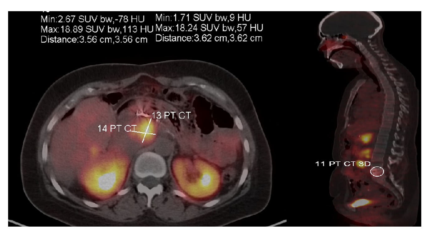
Figure 3: Gallium DOTATATE scan sowing disease burden at the time of progression on immune checkpoint inhibitor therapy (case 1)

A recent retrospective study from Korea evaluated PD-L1 expression in metastatic gastroenteropancreatic (GEPNET) patients through immunohistochemical analysis. 7 out of 32 patient tumor tissues (21.9%) were found to be positive for PD-L1. Grade 3 GEPNETs were especially correlated with PD-L1 expression (p = 0.008) [22]. Additionally, the researchers found that patients expressing PD-L1 had a shorter progression-free survival time and a shorter overall survival. The presence of PD-L1 was also linked to a higher tumor grade (grade 3) in metastatic GEPNETs. The presence of PD-L1 in these patients could act as a biomarker to predict survival.