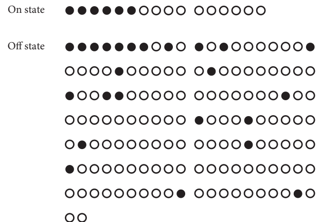
FIGURE 2: Different urination processes in on/off state. (a) one of the circles represents that the duration of urination lasted about 6 seconds (10 circles represent 1 minute, a row of circles in one line represents 2 minutes in total). (b) A black circle indicates that the urinary flow lasted less than 3 seconds (including no flow). (c) A white circle indicates that the urinary flow lasted more than 3 seconds.

The “Off” freezing phenomenon is more commonly observed than the “on” freezing phenomenon [11, 12].