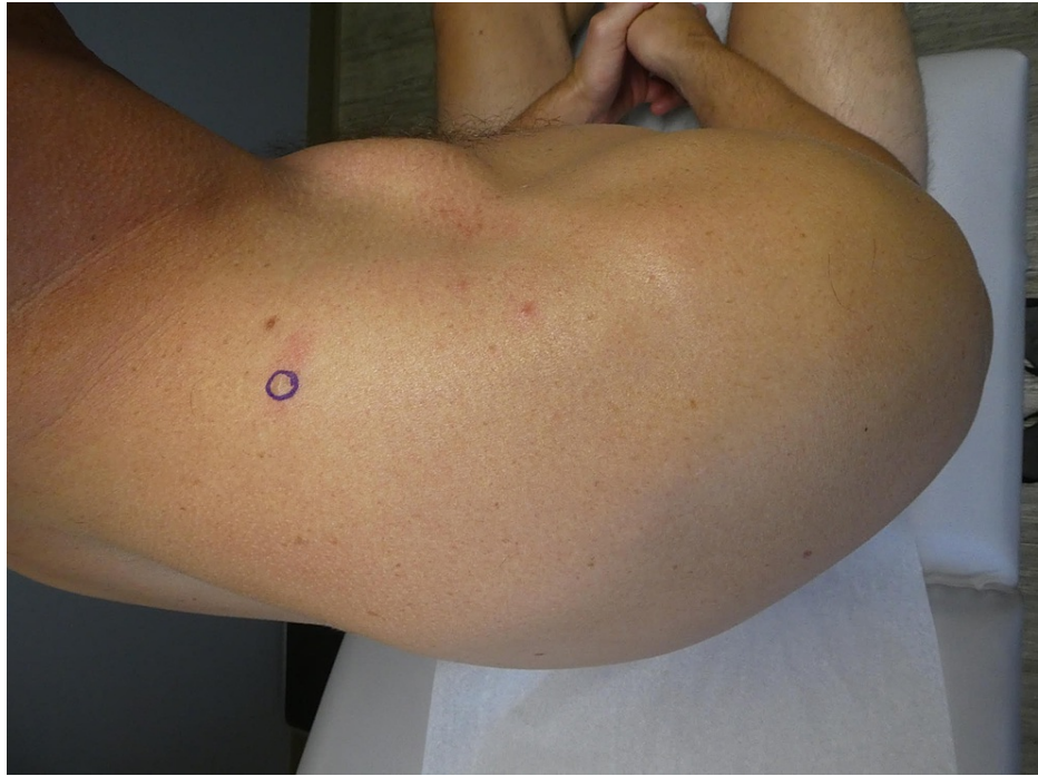
FIGURE 1: Clinical presentation of a solitary cutaneous focal mucinosis

Posterior-superior view of the right upper shoulder of a 37-year-old man whose solitary cutaneous focal mucinosis presented as an asymptomatic isolated four-by-six millimeter skin-colored nodule (circled in purple).