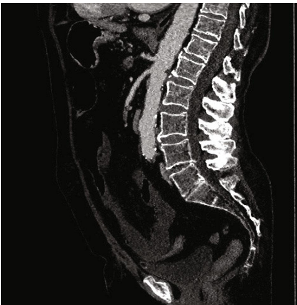
FIGURE 1: Computed tomographic angiography (angio-CT) of abdominal blood vessels in a patient with acute mesenteric ischemia of embolic cause. A clot obstructing the vessel lumen is visible.

with bowel resection was performed. Exploratory laparotomy without a therapeutic procedure (Figures 2(a)–2(c)) was performed for 13 (31.71%) patients; resection was not performed due to the extent and advancement of lesions within the small and large intestines.