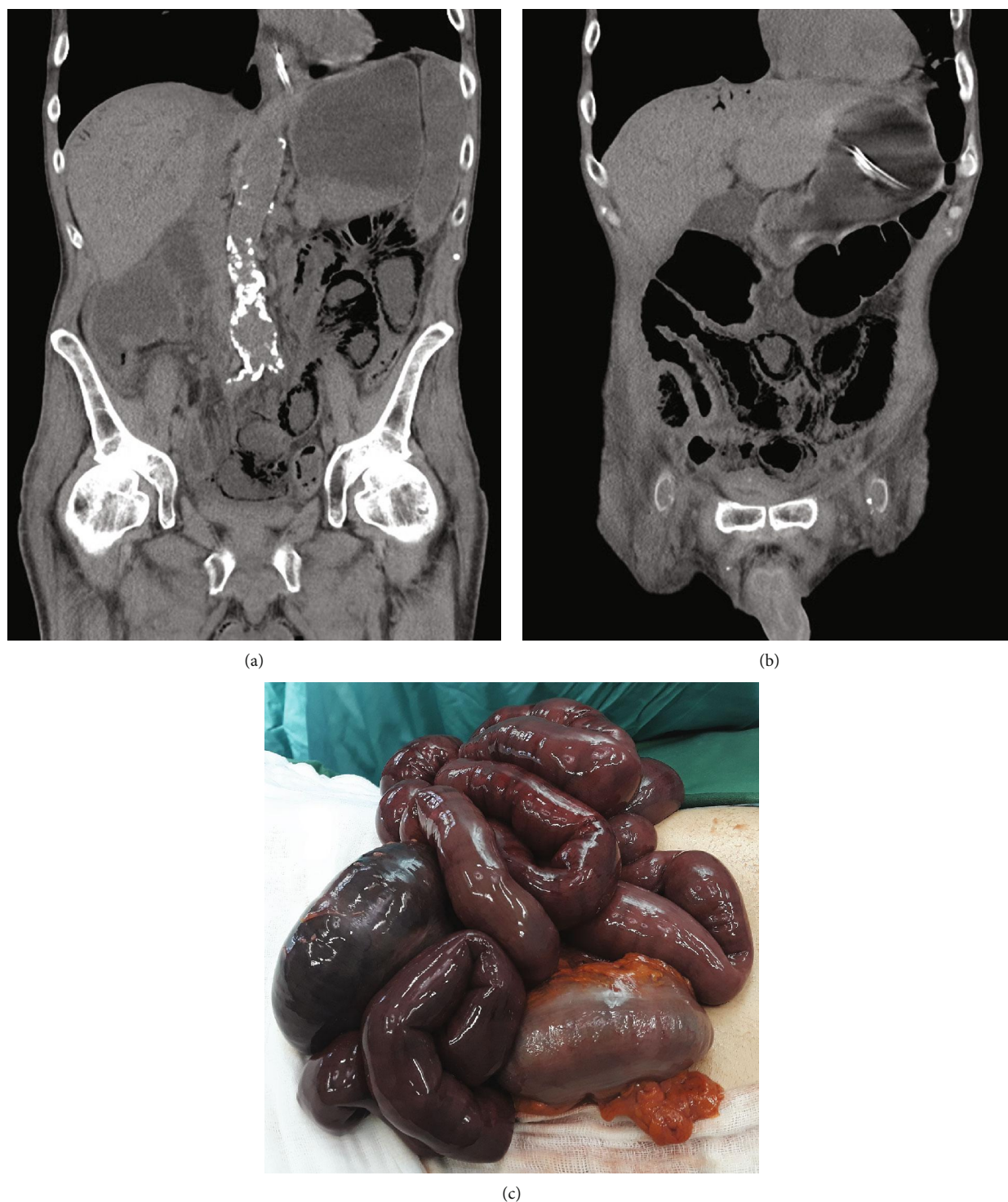
FIGURE 2: (a, b) Multiphase computed tomographic angiography (angio-CT) of the abdominal cavity and pelvis in a patient with acute mesenteric ischemia without symptoms of peritonitis. Signs of intestinal obstruction and pneumatosis of the small and large intestinal walls due to an embolism of the superior and inferior mesenteric arteries. (c) Intraoperative view of the same patient. Widespread necrosis of the walls of the small intestine and colon was revealed during exploratory laparotomy. Resection was not performed due to the advancement and extent of necrotic changes.

have suggested using the P-POSSUM scale to accurately assess the risk of complications and death during the perioperative period and during vascular surgery [13, 16, 17]. Our study showed that the scores of the P-POSSUM scale corresponded