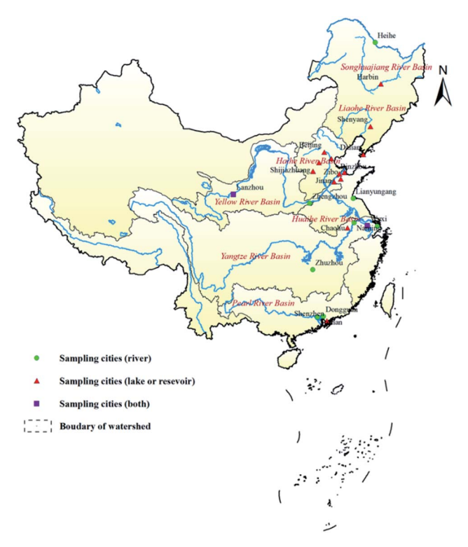
Fig. 1 Location of sampling cities in seven major river basins in China.

2.1.3 Experimental reagents and chemicals. A MC-LR standard product obtained from Taiwan Algae Research Co., Ltd. was used. The MC-LR standard solution was made up to a 20 \mu g mL<sup>-1</sup> stock solution with methanol and stored at -4 °C. The solid phase extraction column was obtained from Waters Oasis® HLB.DC HP (20 \mu m , 2.1 mm \times 30 mm, reusable), and disposable needle filters (25 mm) were purchased from Acrodisc GHP 0.2 \mu m (Pull, USA).