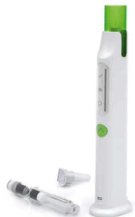
Figure 3 Skytrofa electronic delivery device and its features. 39

Note: Reproduced with permission from Ascendis. SKYTROFA™ (lonapegsomatropin-tcgd) for injection, for subcutaneous use; 2021. Available from: https://www.accessdata.fda.gov/drugsatfda_docs/label/2021/761177lbl.pdf . © 2022 Ascendis Pharma. All rights reserved. SKYTROFA™, Ascendis®, TransCon®, the Ascendis Pharma logo and the company logo are trademarks owned by the Ascendis Pharma Group. 39