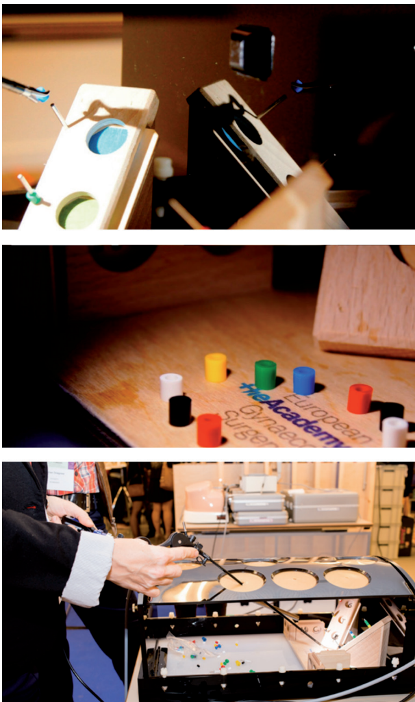
Fig. 3. — LASTT training and testing method

requirements for the diploma of the corresponding level (Fig. 2).