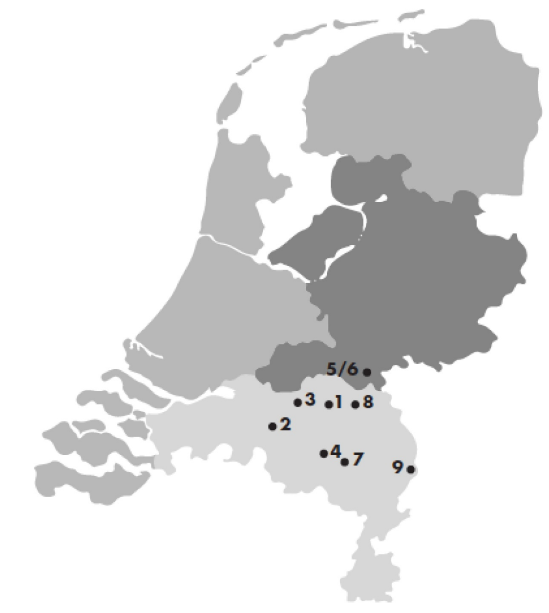
Figure 1. Regional infection cohort departments South-East Netherlands.

An analysis of prospectively registered data on patients diagnosed with an acute THA or TKA PJI, between 2014 and 2016, in nine hospitals in the South-East of the Netherlands was performed. Figure 1 . The nine hospitals comprises a variety of academic, peripheral and private clinics. Data entry was reviewed (M.K., M.vd.S.) and controversies or contradictions were double-checked and if necessary corrected by the contact person at each hospital.