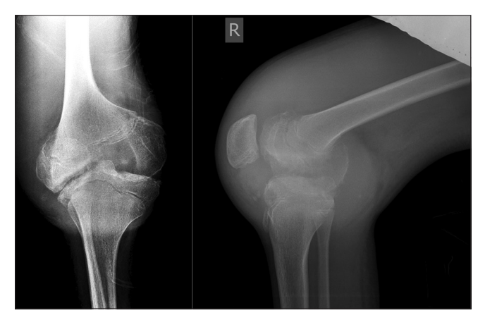
Figure 5: Radiographs showing painless knee destruction in a pediatric patient (Case 9)