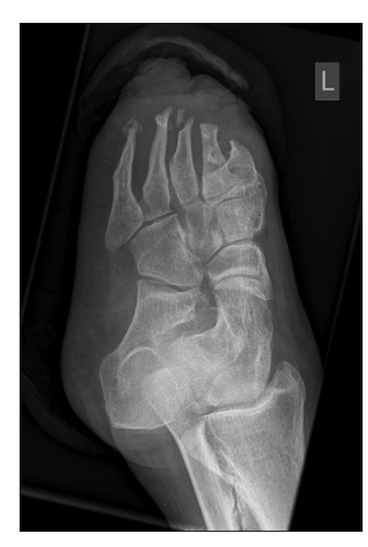
Figure 7: Radiograph of a foot showing amputation of all toe phalanges and distal metatarsals (Case 3)