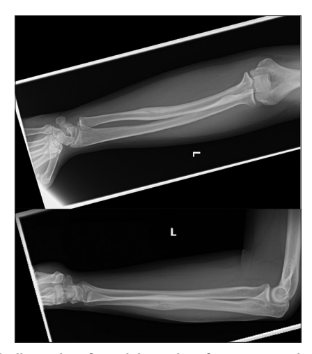
Figure 6: Radiographs of a painless ulnar fracture associated with the use of walking aids due to extensive lower limb manifestations (Case 8)

attempted reconstitution and consolidation, the surgical management centered around extensive debridement and supramaximal fixation. This was not without risk of