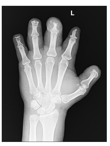
Figure 8: Radiographs showing distal phalangeal involvement in one patient (Cases 3)

Knee joint destruction with or without fractures around the knee joint often resulted in significant instability and deformity. In the four cases with significant knee destruction (Cases 1, 2, 7, and 9), we initially employed the use of casts or hinged knee braces, walking aids, and/or the use of a wheelchair. Three patients subsequently required a knee arthrodesis (Cases 1, 2, and 7); this was performed