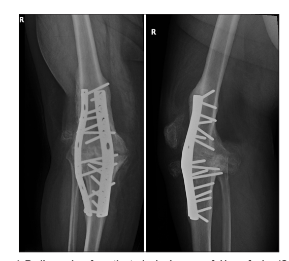
Figure 4: Radiographs of a patient who had successful knee fusion (Case 1)