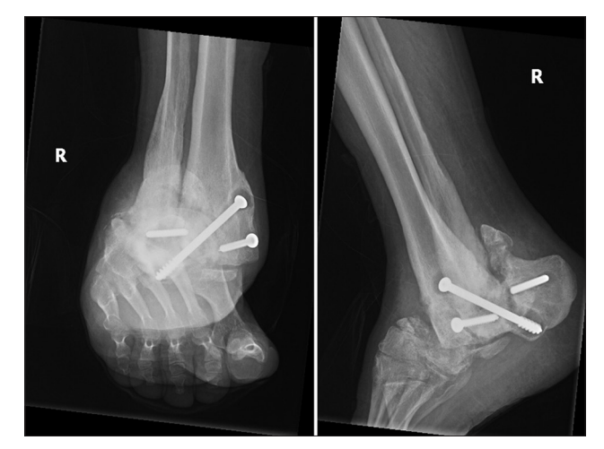
Figure 2: Radiographs of a patient with a failed hindfoot fusion (Case 2)

As the mid-foot and hind-foot destruction progressed through the recognized stages of a neuropathic foot, that is from the initial acute fragmentation to coalescence to