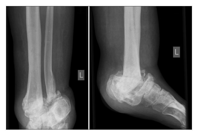
Figure 1: Images showing extensive left ankle destruction (Case 8)