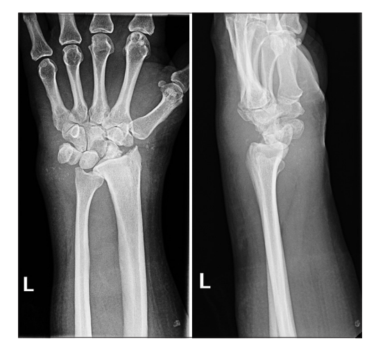
Figure 9: Radiographs of a patient with wrist arthropathy and destruction (Case 7)

complications as the altered pain and healing response in these patients compounded by the potential risk for persistent deep low-grade infection meant that the arthrodesis was likely to fail to unite fully. This was the case in all five patients who underwent this procedure. On further review, two of these cases had persistent painless hindfoot movement and instability (Cases 1 and 6); one underwent a revision hindfoot fusion (Case 2); while the other three required a below-knee amputations (Cases 7, 8, and 9). The techniques employed for fusion in our patients ranged from traditional screws to the use of circular frames.