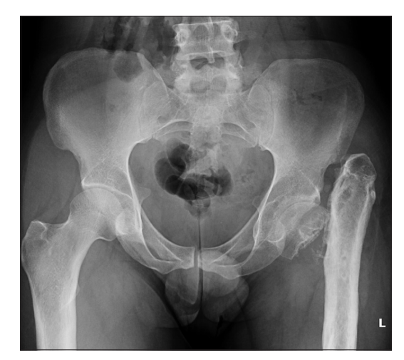
Figure 10: Nonunion of a proximal femoral fracture following infective failure of fixation (Case 3)

using a plate in two cases, and an external fixator in the third case.