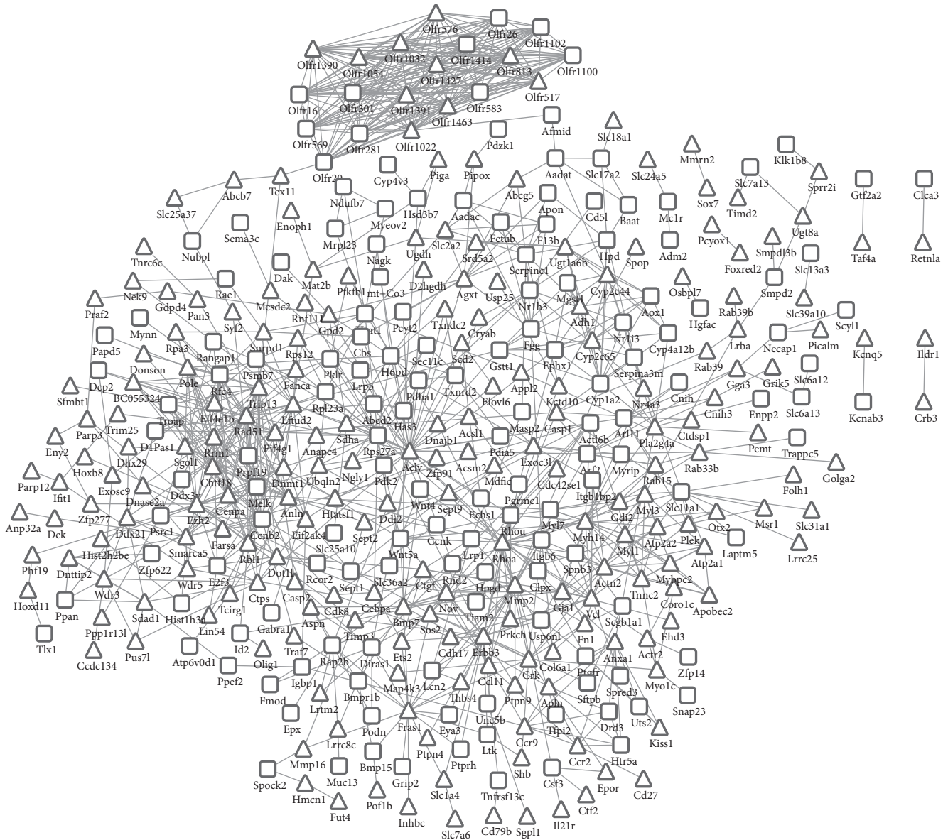
FIGURE 2: The protein-protein interaction network for differentially expressed genes. The trigon represents upregulated genes and the square represents downregulated genes.

predicted for module genes and involved in 34 TF-target pairs (Figure 3).