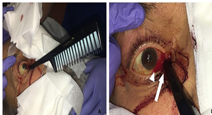
Image 1. Hair comb impaled into the right inferomedial orbit (A) with higher magnification (B) of the foreign body with right conjunctival laceration at the nasal limbus extending inferonasally (arrow) with associated subconjunctival hemorrhage (arrowhead).

To avoid further ocular damage, the decision was made to emergently remove the comb at the bedside with topical proparacaine and IV fentanyl. The ophthalmologist gently removed the comb using steady traction after sterilizing the surgical field with topical betadine. The patient was admitted for further management of his hepatic disease and psychiatric evaluation. He was continued on topical erythromycin ointment and neomycin-polymyxin-dexamethasone drops, IV piperacillin/tazobactam, and IV levofloxacin. He also received three days of IV dexamethasone for optic neuropathy. His afferent pupillary defect resolved by hospital day 2 and his visual acuity improved to 20/70 in both eyes. On discharge (hospital day 13), he had regained full extraocular motility, and his conjunctival laceration and subconjunctival hemorrhage were healing well and did not require further